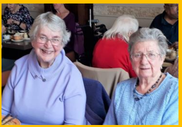
"Our first time – Lovely"