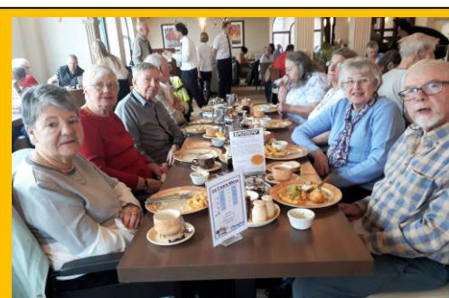
"More Smiling Faces"