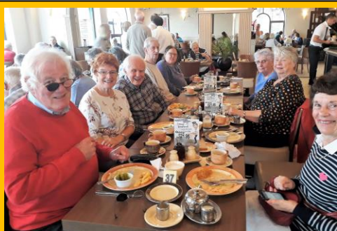
"Empty Plates – Smiling Faces"