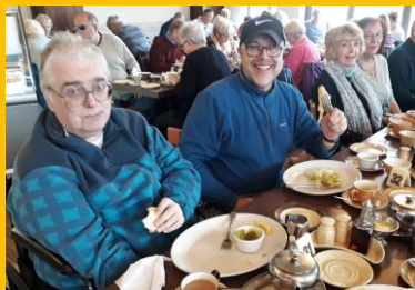
"Now't left on this plate"