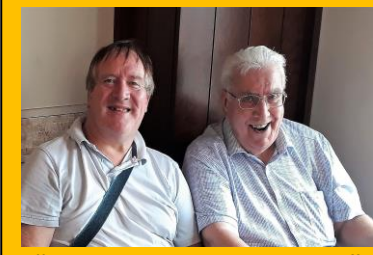
"Stuck away in the Corner"