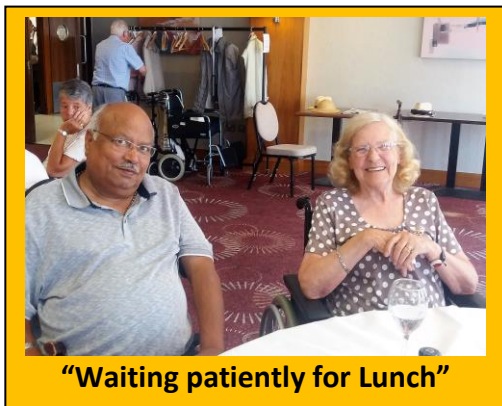
"Waiting patiently for Lunch"