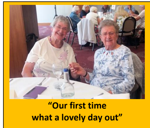
"Our first time what a lovely day out"