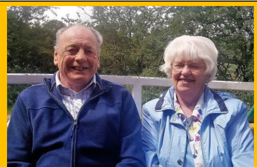
“We are happy”