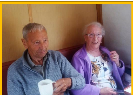
“When is this buffet being served?”