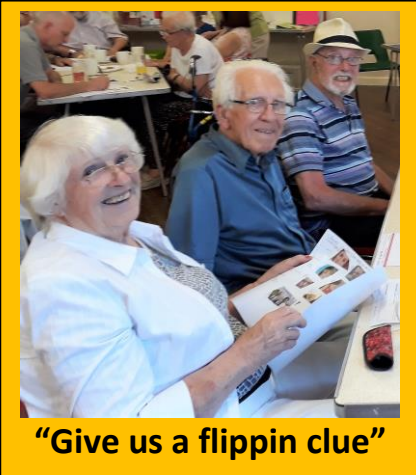
"Give us a flippin clue"

It was that hot today I did not expect to see many of you today, but you must have heard that the hall was nice and cool, as we had a reasonable turnout in the end.