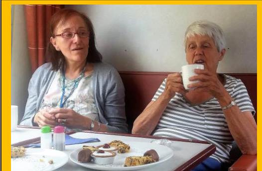
“Fed and watered”