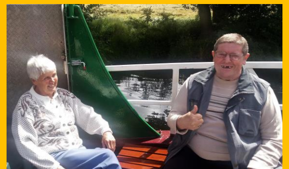
“Smile from me, thumbs up from him”