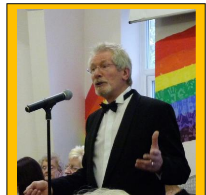
“As if we never said Goodbye”

I will always end this front page in acknowledging our great volunteers and helpers. If the members could see what you do before and after the event I am sure they would be amazed. ‘Thank you’.