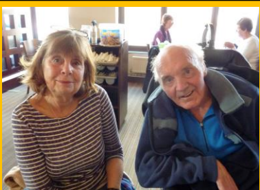
‘First time – so friendly’