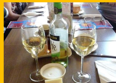
‘Who owns these?’