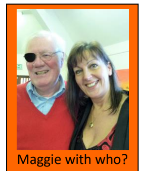
Maggie with who?

Canal Trips: see page 3 Southport: see page 4