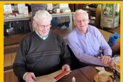
‘Oh Ken- Curry on Fish? Yuk’