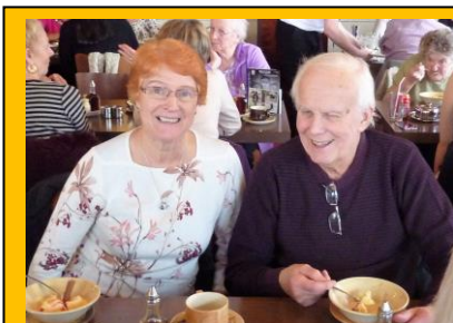
‘Always finish with Apple pie’