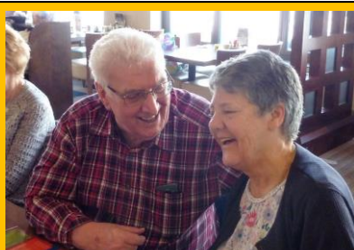
‘It’s all about having a laugh’