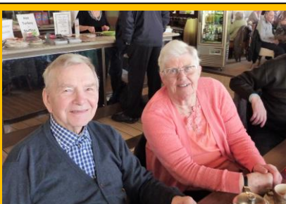
‘Fed and Comfortable – thanks’